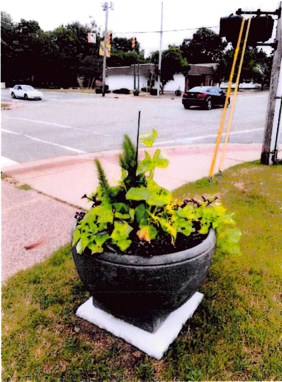
Small 33 Plant