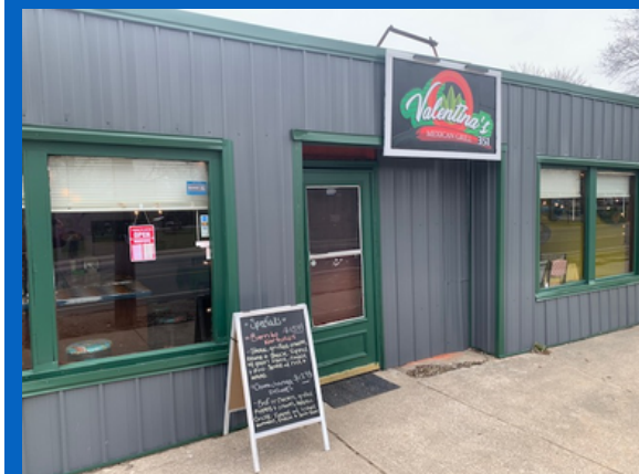
Valentina's Mexican Grill took advantage of the Façade Improvement Program for a new sign for their business located at 351 River Street