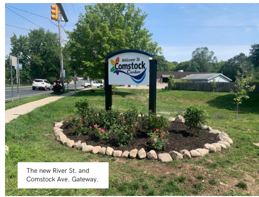
The new River St. and Comstock Ave. Gateway.