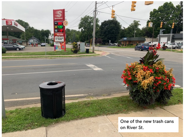
One of the new trash cans on River St.