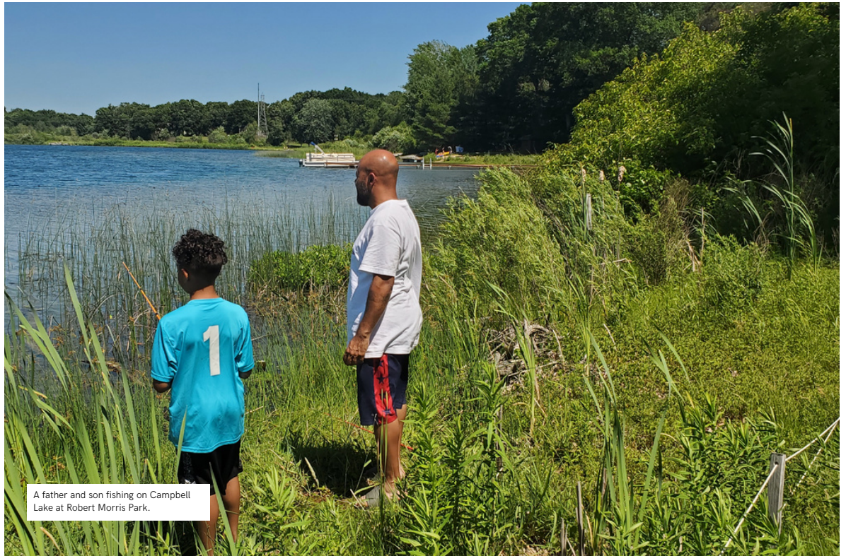
A father and son fishing on Campbell Lake at Robert Morris Park.

Happy July! It's summer time! Put on sunscreen and come on out to some fun community events for the whole family. Find details on those events and much more important information, such as: