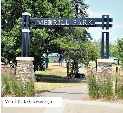
Merrill Park Gateway Sign

The Comstock Center DDA and Comstock Parks and Recreation are teaming up to expand the festival at Merrill Park. It will be family-focused with food, music, and activities for everyone. The event theme is "Flowers and Floats" and will include Wenke Greenhouses and River Street Flowerland flower sales. There will be free ice cream floats and games. Food is offered for sale by downtown restaurants and food trucks. So, grab the family and drive, bike, walk, scooter or float the river to Merrill Park for Fall Fest - Flowers and Floats on Saturday, September 23, 2023, from 12 pm to 3 pm!