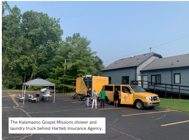
The Kalamazoo Gospel Missions shower and laundry truck behind Hartleb Insurance Agency.