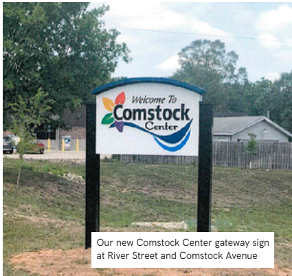
Our new Comstock Center gateway sign at River Street and Comstock Avenue

There is a new Comstock Center gateway sign at River Street and Comstock Avenue. to welcome visitors from the south and west to downtown. The Comstock Center DDA added the new sign to continue the overall effort to beautify and brand the district. New landscaping will also be added to brighten up the entryway.