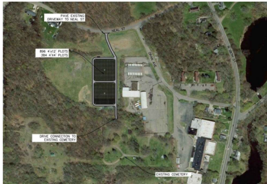
Above: Preliminary drawing of the proposed expansion plans

An expansion of Comstock Cemetery will be completed by the end of August, offering over 1200 more plots, around 375 of those being smaller cremation-only plots. The expansion will extend into the old ball diamonds on Neal St. The new entrance will be off Neal St and the current entrance will be closed. With very few plots left in the current cemetery, the expansion will be able to accommodate burials well into the future. We'll start selling plots in the fall.