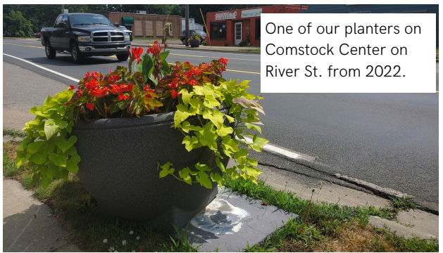
One of our planters on Comstock Center on River St. from 2022.