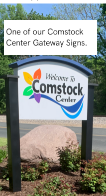
One of our Comstock Center Gateway Signs.

Comstock Center will have a new gateway sign installed on River St. and Comstock Ave. to match the attractive entry signs that were installed last summer. With the heavy vehicle, bike and pedestrian traffic at this intersection the DDA believes it will add a welcoming touch to the south end of the district.