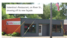
Valentina's Restaurant, on River St., showing off its new façade.

Small improvements in Comstock Center are making a big difference. Niko's Express has reopened, and the restaurant is drawing crowds of residents back to the downtown. Valentina's Restaurant has repaired its façade and expecting to do more enhancements to their building in the coming months. Dyer's Auto Body recently painted the building exterior with a nice color combination to spruce up for spring and to attract customers.