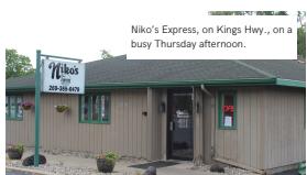
Niko's Express, on Kings Hwy., on a busy Thursday afternoon.