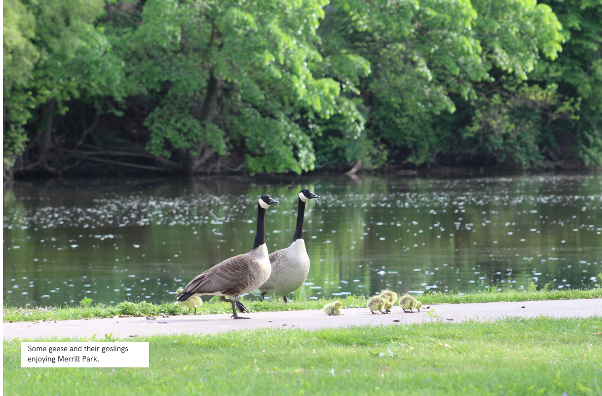
Some geese and their goslings enjoying Merrill Park.

Happy June! It's summer time! Put on sunscreen and come on out to some fun community events for the whole family. Find details on those events and much more important information, such as: