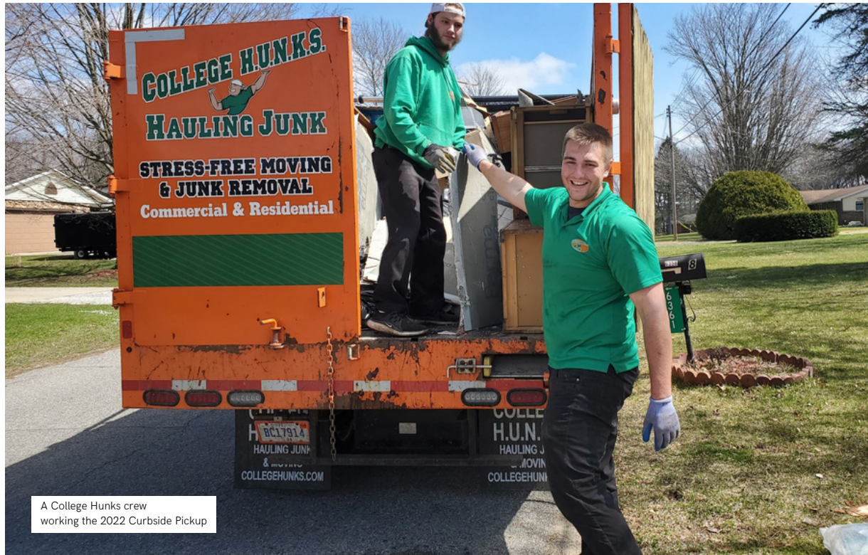
A College Hunks crew working the 2022 Curbside Pickup

Happy May! In this issue, we have important details about curbside pickup, the VFW's upcoming Memorial Day Parade, our Downtown Development Authority, and much more: